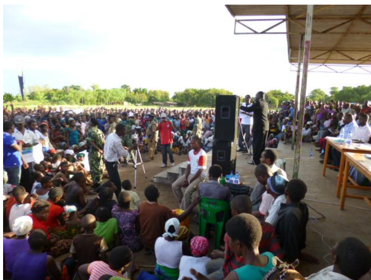
Activists in Malawi organized debates ahead of local elections where citizens asked questions and candidates presented their platforms.

Effectively dealing with transparency, accountability and public integrity issues necessarily involves politics and the competition between values, interests, ideas, preferences and incentives. It also involves power dynamics and, in many instances, the need to manage the possibility of violent conflict. Likewise, the actors are not always “rational” and the tradeoffs might seem unreasonable. These factors preclude linear, mechanistic approaches. Instead, influencing positive change requires exploiting entry points across the entire political cycle, developing alternative centers of power, changing political incentives and building new relationships. Finding the right entry points means making strategic choices about the most viable avenues and opportunities in a given context and choosing the right time.