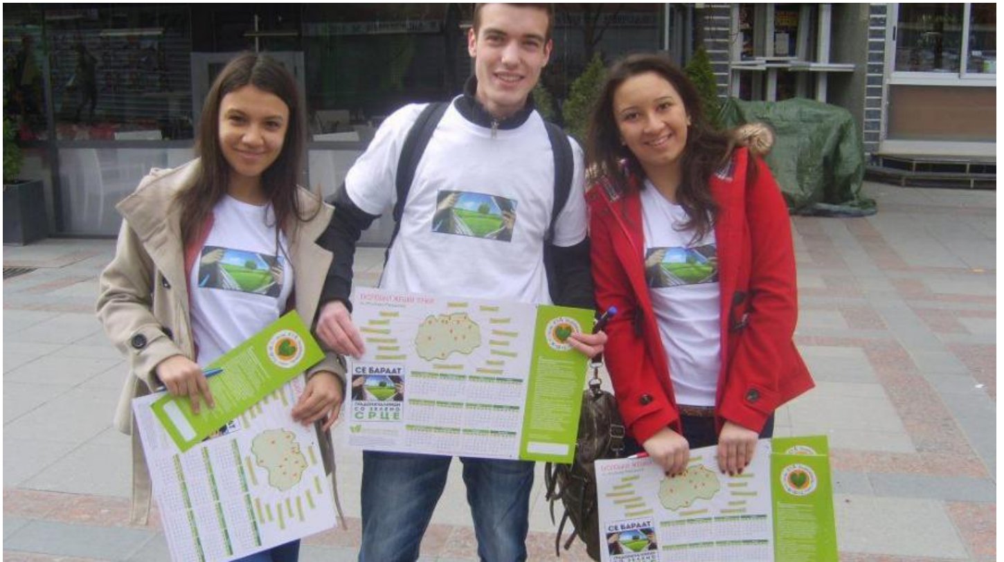
Activists for the Cool Mayors campaign show off outreach materials.

Civic groups require a variety of skills and capacities for this kind of work, including strategic planning, mapping the political terrain, building relationships, develop credible narratives and drawing on evidence to support policy positions. In addition to these skills, groups must also learn to take appropriate actions at each stage of the political cycle. Understanding how to take advantage of the political openings created by elections is critical to long term organizing strategies. Once you have determined your issue organizing strategy for upcoming elections, the following tools drawn from the country cases presented on this site, as well as those developed by other activists around the world, may provide inspiration as you implement your own activities.