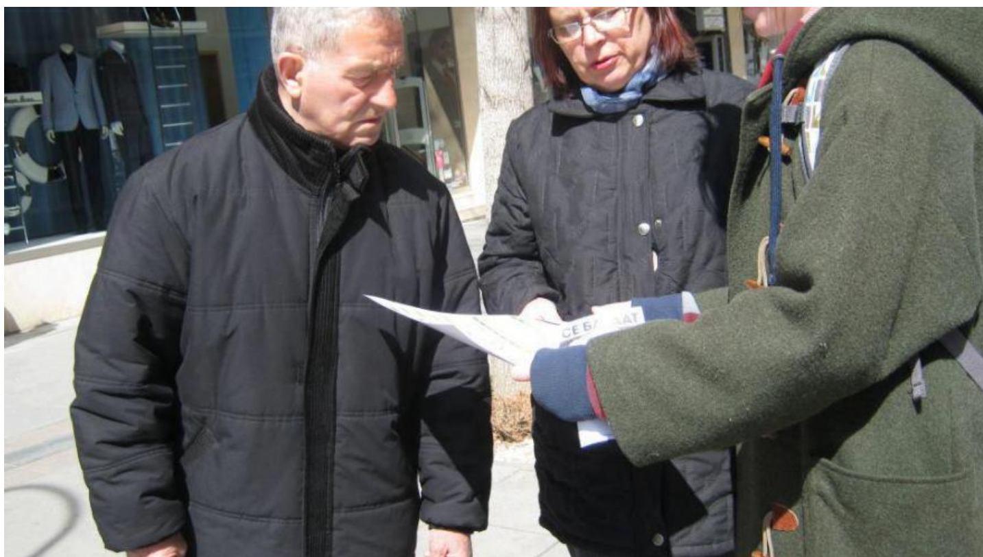
Activist in Macedonia shares information with potential voter about Cool Mayors campaigns.