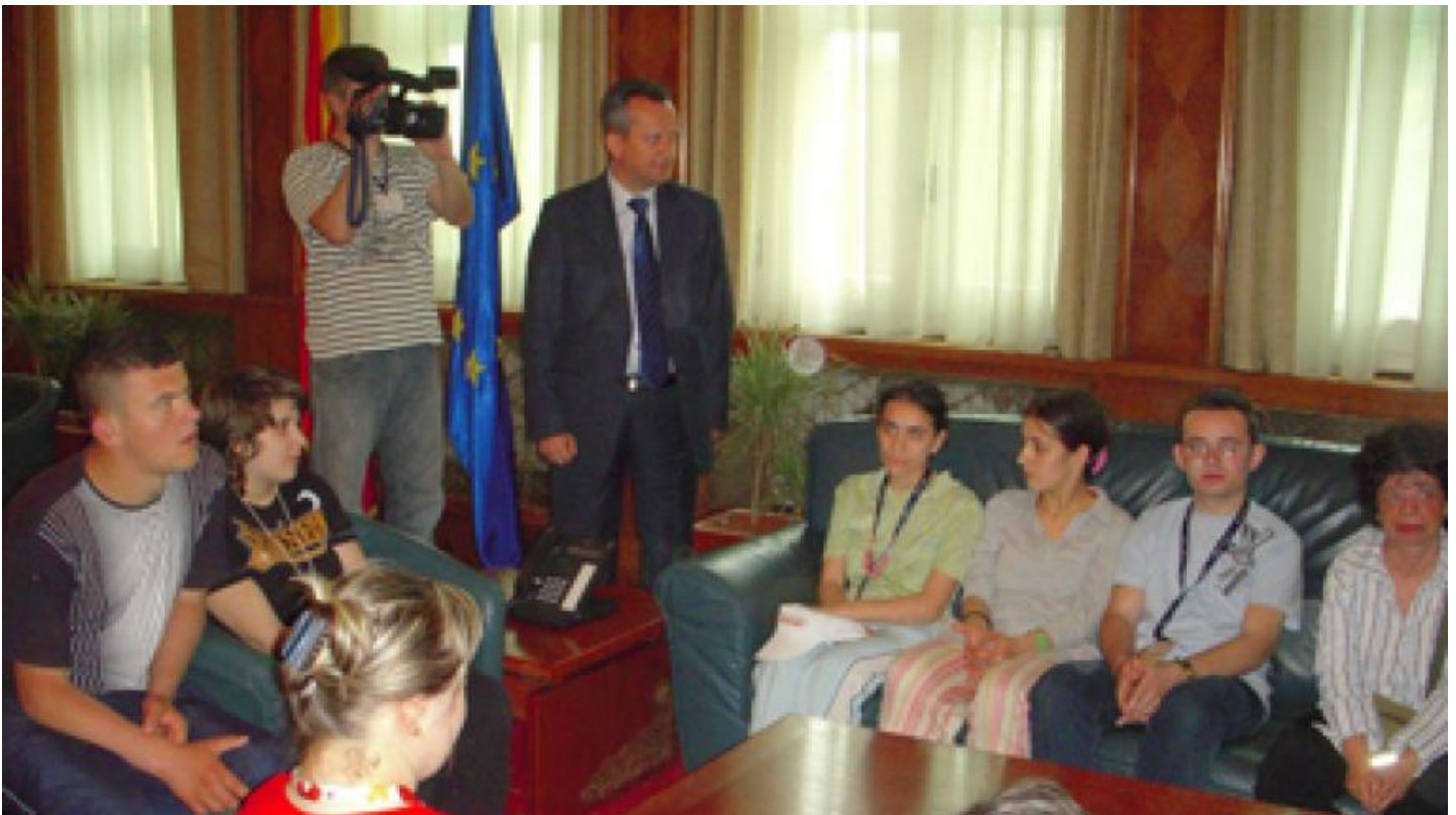
Poraka members visit Assembly Speaker Trajko Veljanoski to urge ratification of the U.N. Convention.