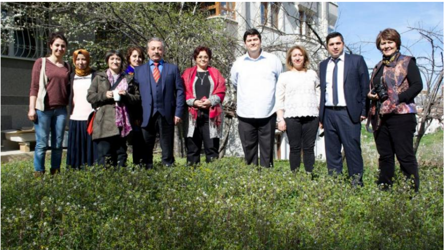
Diverse activists from all seven regions of Turkey gather at NDI's Ankara office to be trained as local organizers and facilitators for CBN.

In new and emerging democracies, citizens must organize and engage government in order to shape appropriate accountability relationships. In most