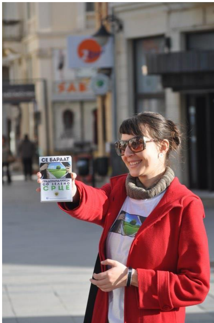
Activist for the Cool Mayors campaign shows off outreach materials.

In each case, experienced NDI organizers provided technical assistance to the partners as they developed and ran their strategic campaigns. Assistance included a combination of training, individualized consultations, on-the-job coaching, and facilitated discussions to reflect on their activities, learn from experience and chart next steps. NDI also worked to connect partners with potential allies in the legislature, political parties, government, media, academic institutions and other civic organizations. Groups also received small amounts of financial assistance from NDI to help with their organizing.