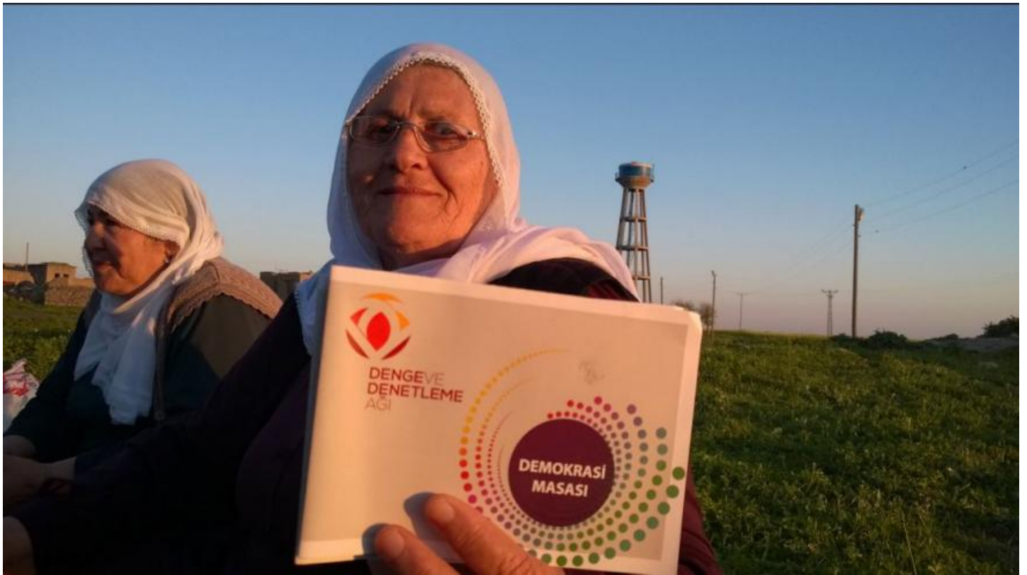
Ahead of the June 2015 general election, residents of the southeastern city of Mardin receive materials on checks and balances issues during community outreach by local CBN members.