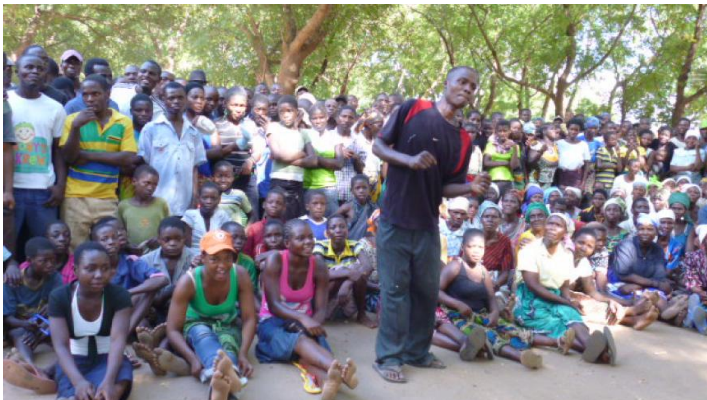
Citizen poses question about community priorities to candidates during debate for ward councilor elections.

For advocacy efforts to really make sustained improvements in people’s lives, activists need to take into account the power imbalances that block change and adopt politically aware strategies to address them. Elections can be an important component of such strategies. The following recommendations are offered to democracy and governance practitioners and development professionals seeking to implement programs that support efforts of civic groups to effect change through politics. For more context, check out the Country Cases on this site.