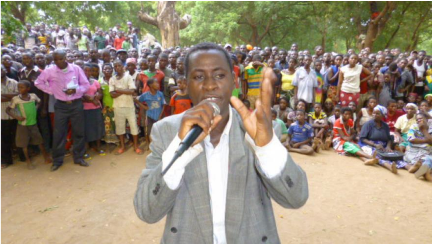
Ward councilor candidate speaks to citizens about his platform ahead of local elections in Malawi.