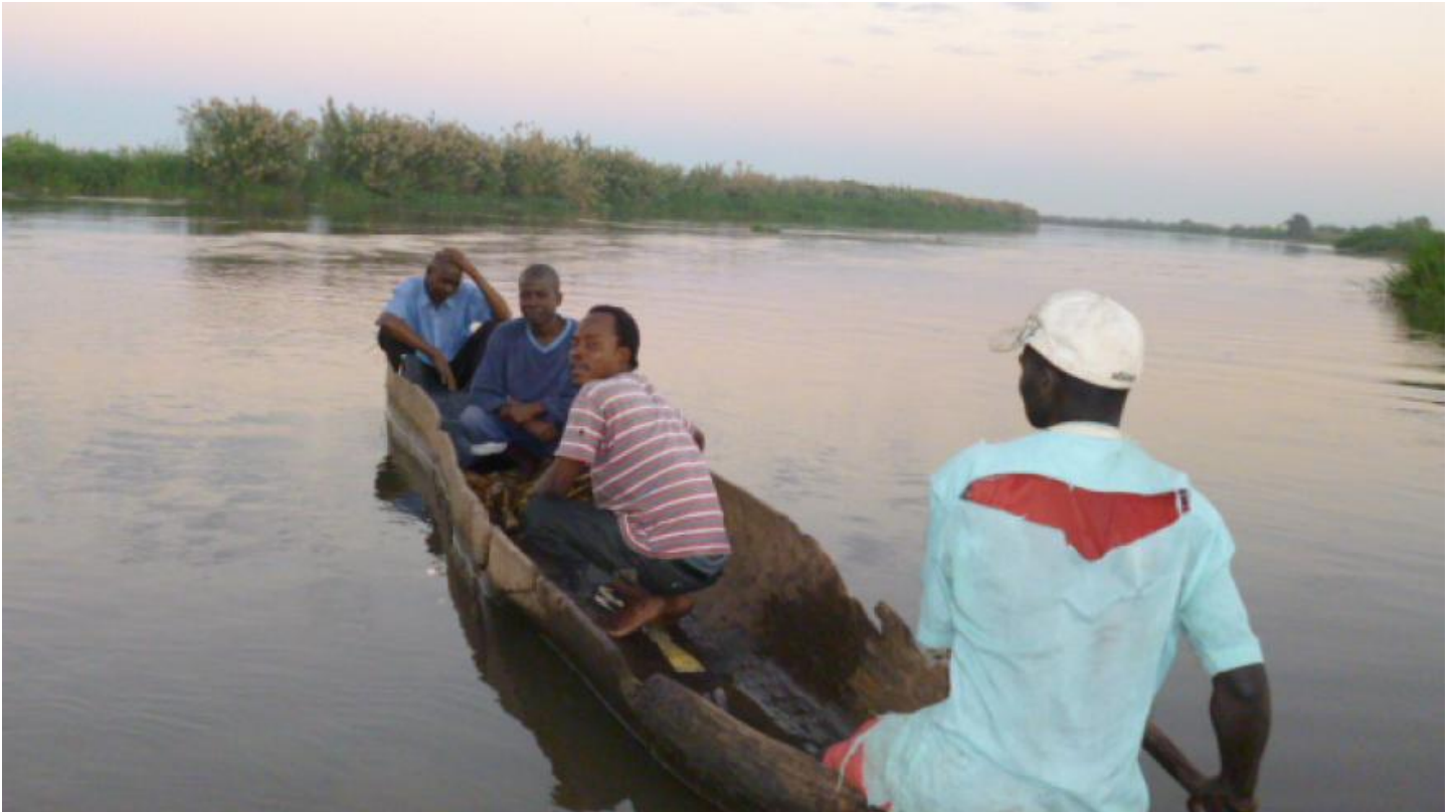
Organizers from Tiphedzane travel to remote communities by canoe for pre-election activities.