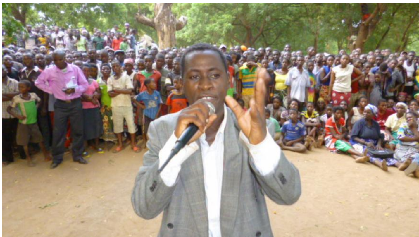
Ward councilor candidate speaks to citizens about his platform ahead of local elections in Malawi.