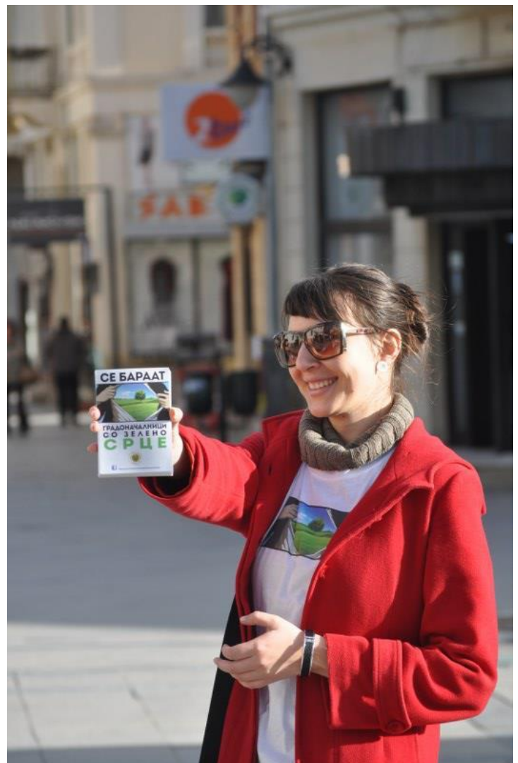
Activist for the Cool Mayors campaign shows off outreach materials.

This NDI study describes the value of factoring election periods into strategic campaigns and draws lessons from Malawi, Macedonia and Turkey. In Malawi, organizations from different municipalities identified community priorities and organized candidate debates in the lead up to long-delayed local elections. In Macedonia, groups petitioned candidates and gained commitments on policy actions they would take once elected. In Turkey, presidential elections created space for the consolidation of a broad-based civic network focused on government checks and balances. NDI staff members conducted key informant interviews in each country to