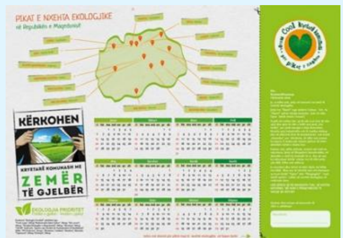
Cool Mayors Campaign Pledge and Calendar