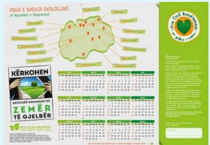
Cool Mayors Campaign Pledge and Calendar