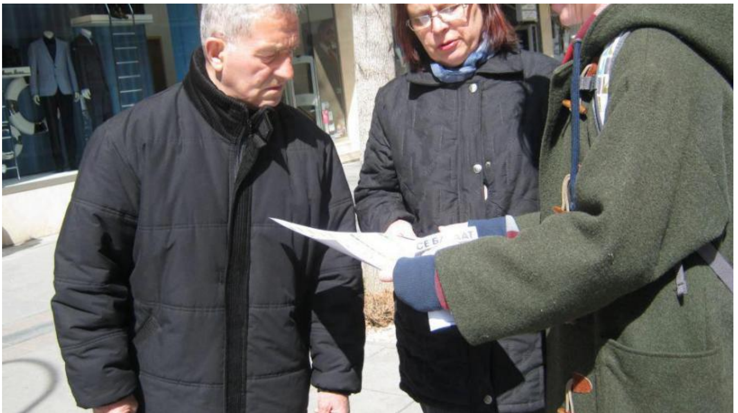
Activist in Macedonia shares information with potential voter about Cool Mayors campaigns.