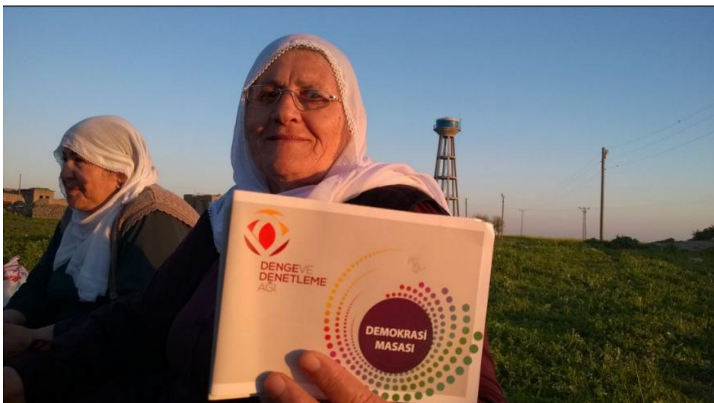
Ahead of the June 2015 general election, residents of the southeastern city of Mardin receive materials on checks and balances issues during community outreach by local CBN members.