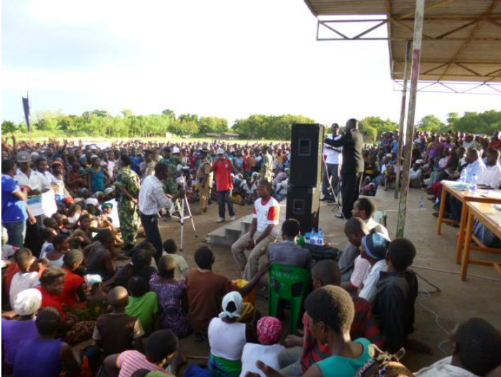
Activists in Malawi organized debates ahead of local elections where citizens asked questions and candidates presented their platforms.

Elections are a principal democratic process, although they alone do not guarantee citizen influence over policy making, the responsiveness of public officials, or their responsible use of state resources. Quality elections matter a great deal, but only insofar as they put citizens in the driver's seat when it comes to steering the work of government. For this reason, elections should be treated as opportunities that not only allow citizens to choose leaders, but that can also begin to position citizens as informed, organized and active participants in policy making.