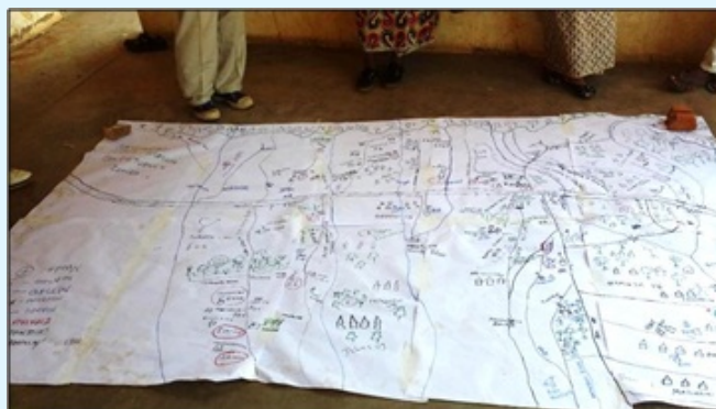
Community Mapping Exercise