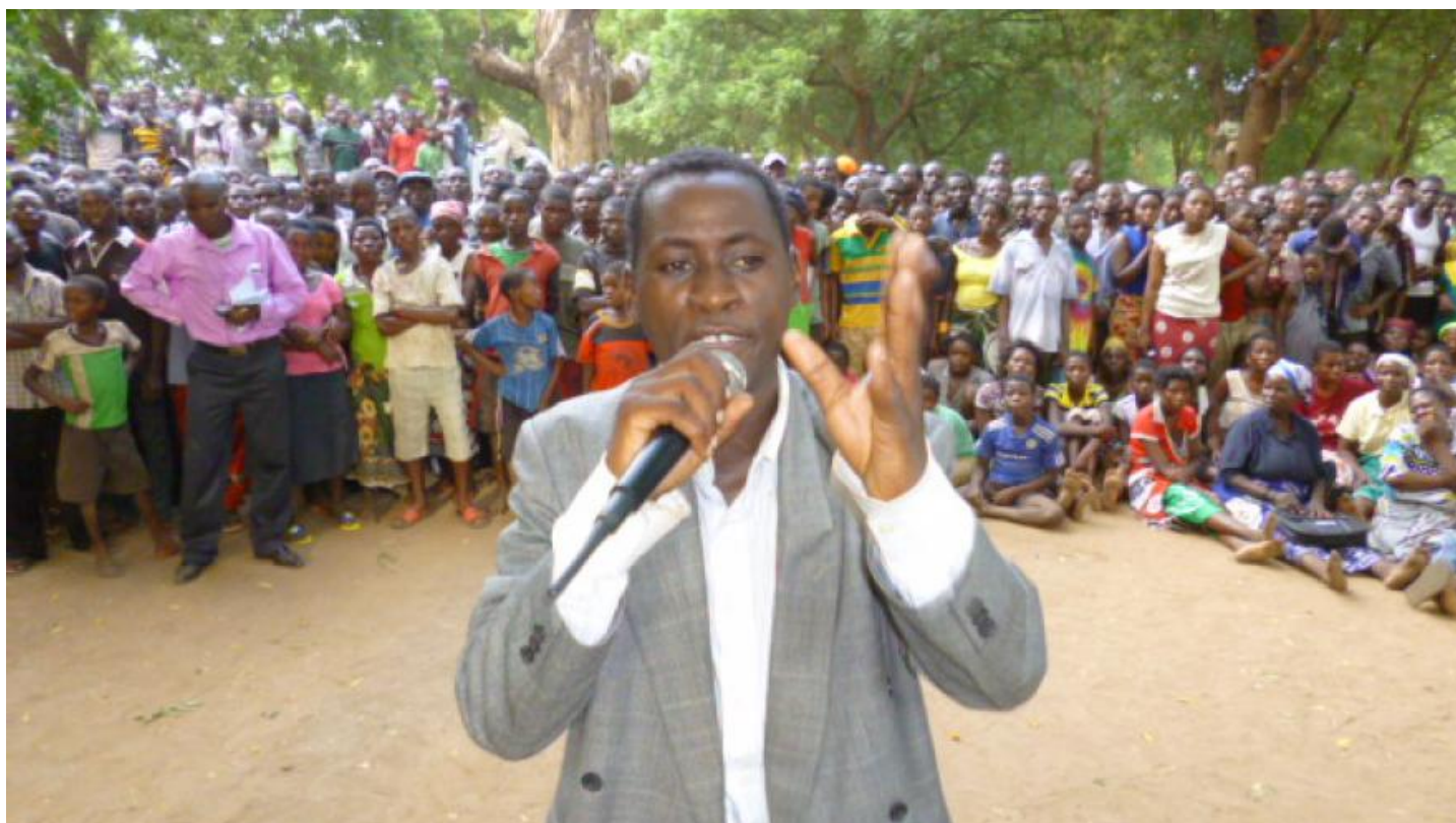
Ward councilor candidate speaks to citizens about his platform ahead of local elections in Malawi.