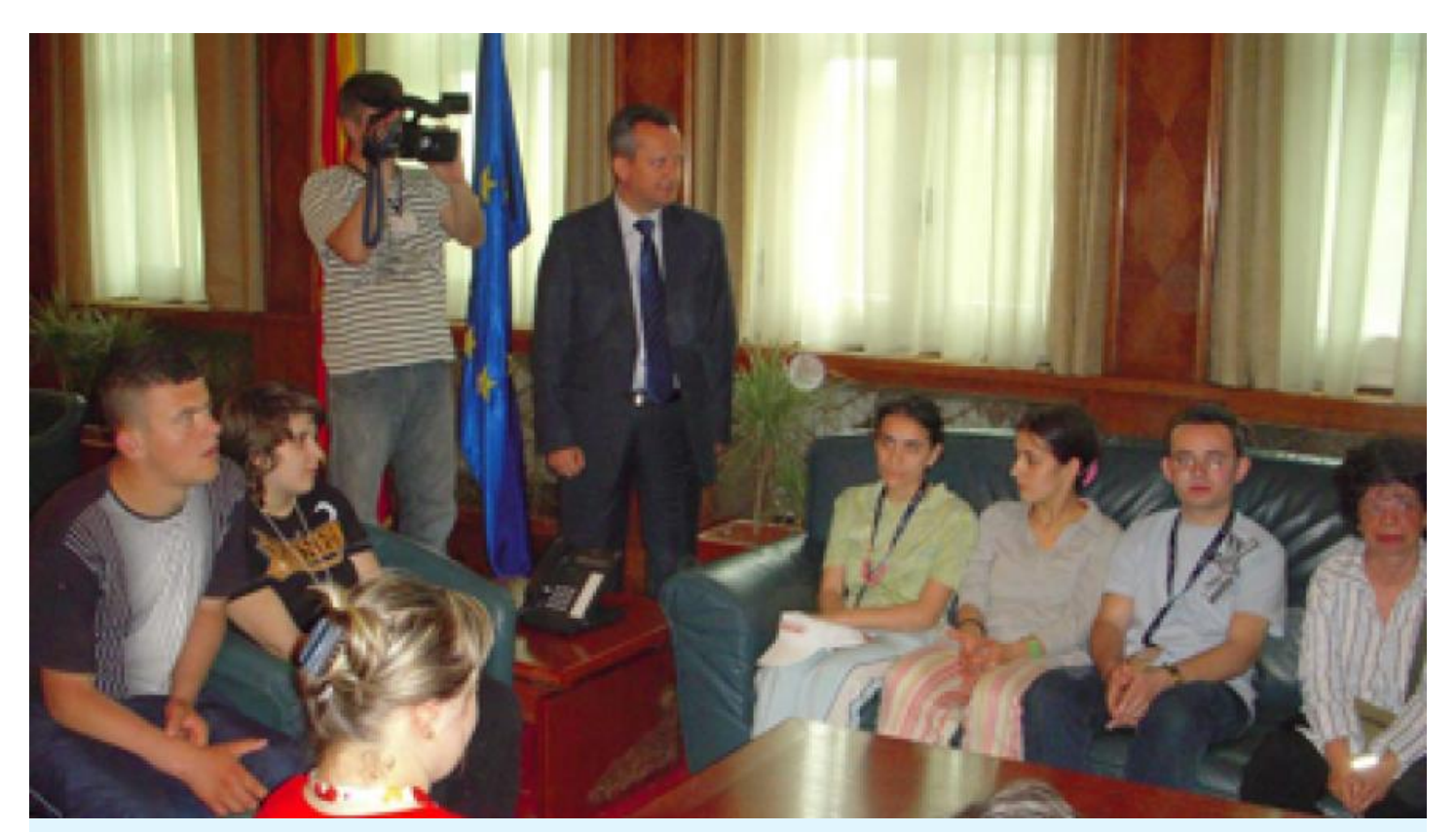
Poraka members visit Assembly Speaker Trajko Veljanoski to urge ratification of the U.N. Convention.