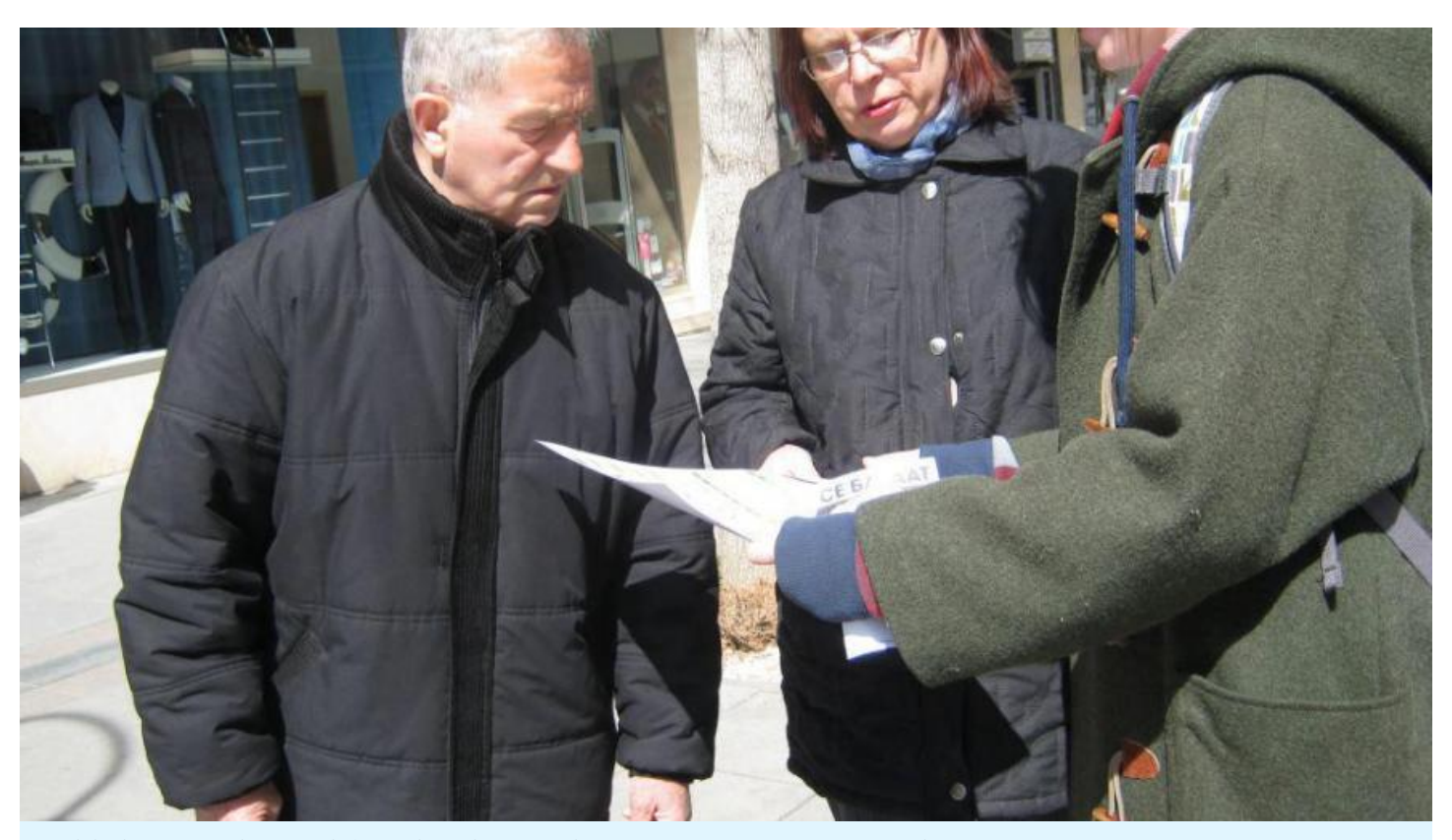
Activist in Macedonia shares information with potential voter about Cool Mayors campaigns.