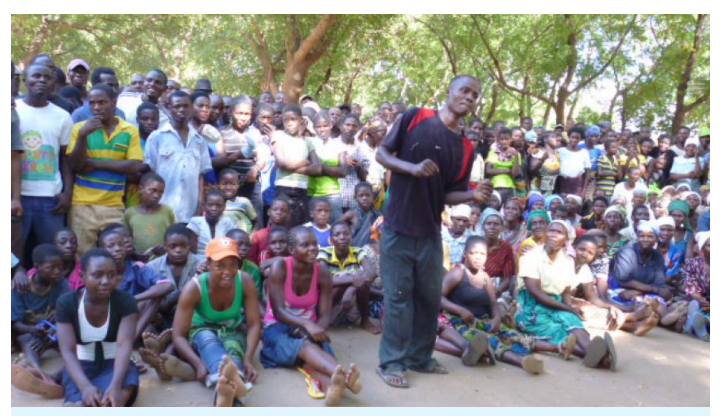
Citizen poses question about community priorities to candidates during debate for ward councilor elections.

For advocacy efforts to really make sustained improvements in people's lives, activists need to take into account the power imbalances that block change and adopt politically aware strategies to address them. Elections can be an important component of such strategies. The following recommendations are offered to democracy and governance practitioners and development professionals seeking to implement programs that support efforts of civic groups to effect change through politics. For more context, check out the Country Cases on this site.