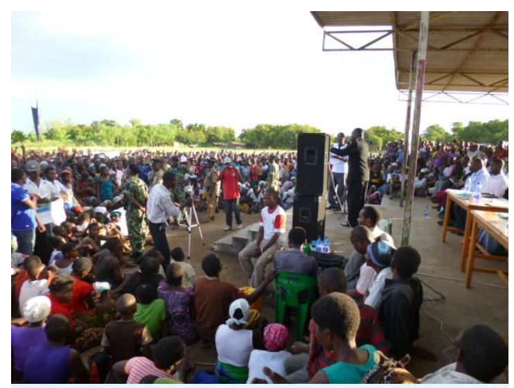
Activists in Malawi organized debates ahead of local elections where citizens asked questions and candidates presented their platforms.

Effectively dealing with transparency, accountability and public integrity issues necessarily involves politics and the competition between values, interests, ideas, preferences and incentives. Is also involves power dynamics and, in many instances, the need to manage the possibility of violent conflict. Likewise, the actors are not always "rational" and the tradeoffs might seem unreasonable. These factors preclude linear, mechanistic approaches. Instead, influencing positive change requires exploiting entry points across the entire political cycle, developing alternative centers of power, changing political incentives and building new relationships. Finding the right entry points means making strategic choices about the most viable avenues and opportunities in a given context and choosing the right time.