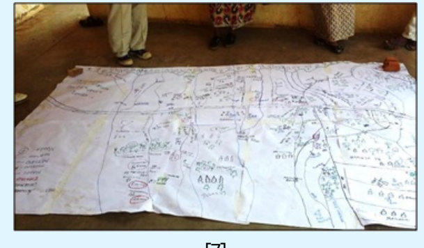
[7] Community Mapping Exercise