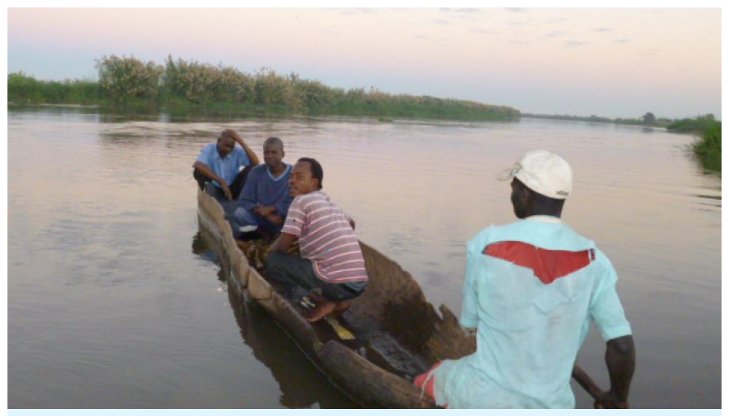
Organizers from Tiphedzane travel to remote communities by canoe for pre-election activities.