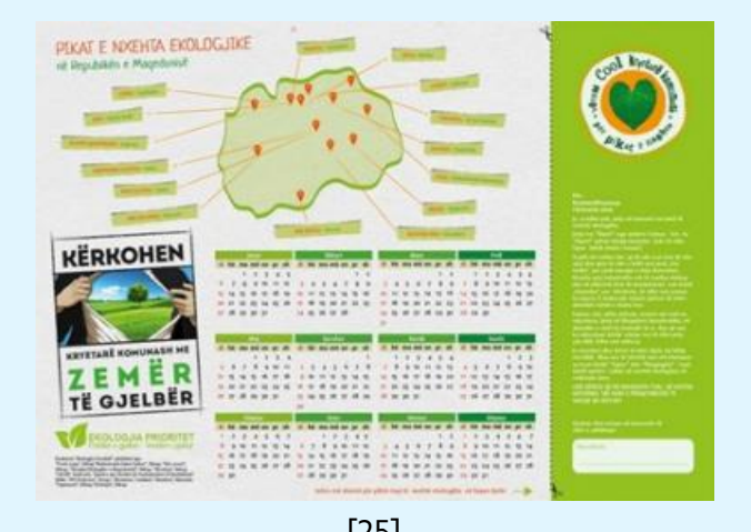
Cool Mayors Campaign Pledge and Calendar