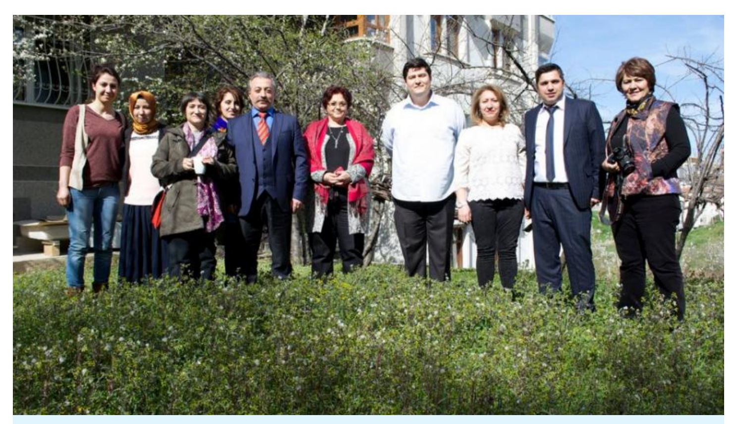
Diverse activists from all seven regions of Turkey gather at NDI's Ankara office to be trained as local organizers and facilitators for CBN.

In new and emerging democracies, citizens must organize and engage government in order to shape appropriate accountability relationships. In most