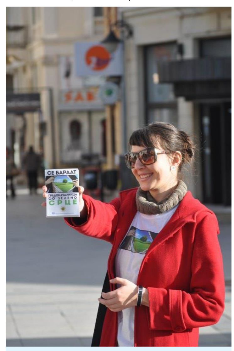
Activist for the Cool Mayors campaign shows off outreach materials.

steps. NDI also worked to connect partners with potential allies in the legislature, political parties, government, media, academic institutions and other civic organizations. Groups also received small amounts of financial assistance from NDI to help with their organizing.