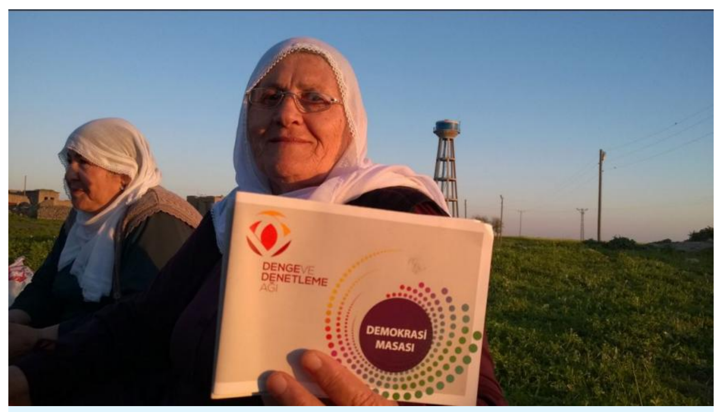
Ahead of the June 2015 general election, residents of the southeastern city of Mardin receive materials on checks and balances issues during community outreach by local CBN members.